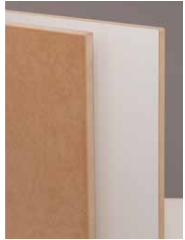
MR MDF - White Back (white melamine on back, raw MDF on front. For all door styles)