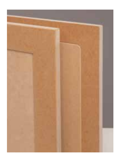
MR MDF - 2 piece (raw MDF both sides, made as a frame and an insert glued in, for Platinum Series only)