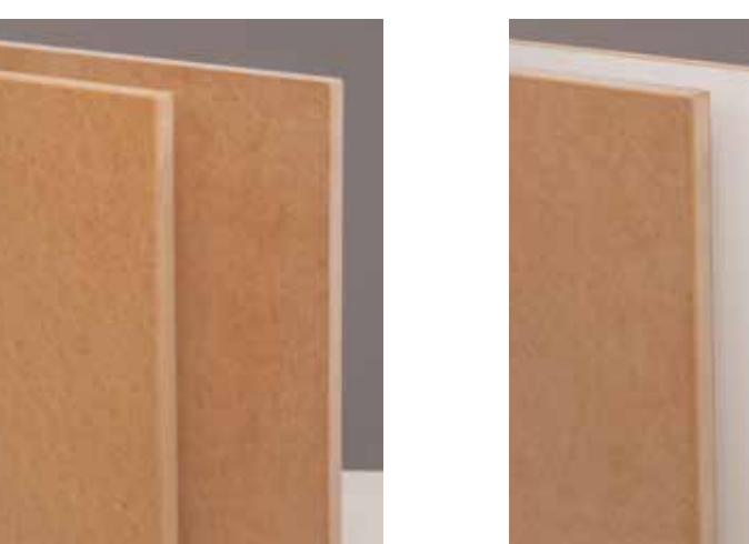
MR MDF (raw MDF both sides, for all door styles except Platinum Series)

The use of moisture resistant (MR) MDF ensures Prestyle keeps its good looks and adds lasting value and elegance to any interior.